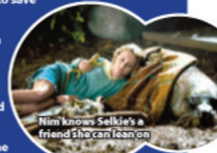
Nim knows Selkie's a friend she can lean on

Nim's best friends are an Australian sea lion, Selkie, and a bearded lizard called Fred. To help Nim scare off the tourists, Fred bares his teeth, spreads his spiked mane and hisses aggressively at them. And it works – they go running in the opposite direction! Selkie, on the other flipper, helps out by letting Nim ride on his back through the ocean, to help her search for her dad. Good luck, Nim!