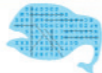
Whale of a wordsearch